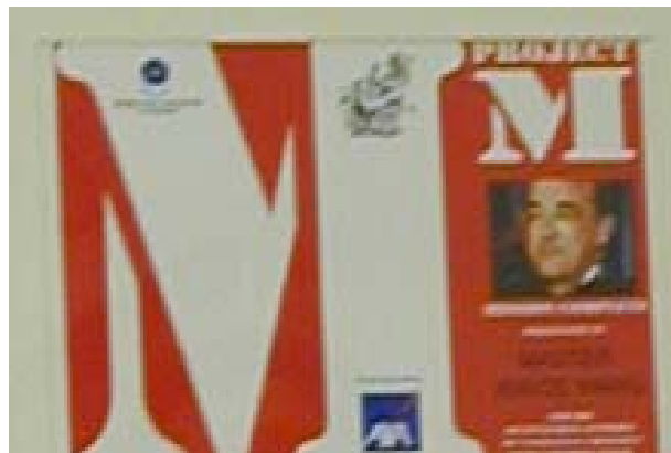
塔州大腦性癱瘓協會紀念狀，感謝 聖 智及 維摩詰 阿達那嘛佛 師尊 對 M 計劃的支持