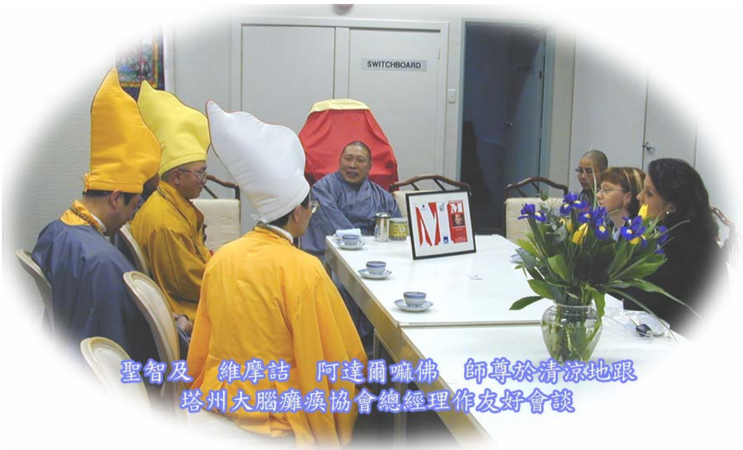
聖智及 維摩詰 阿達爾嘛佛 師尊於清涼地跟 塔州大腦癱瘓協會總經理作友好會談